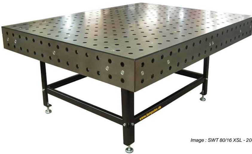
Image : SWT 80/16 XSL - 200