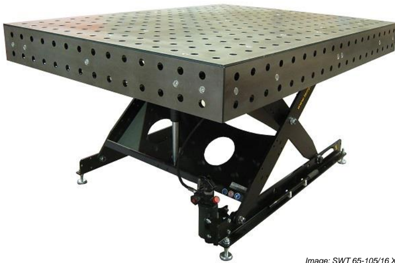
Image: SWT 65-105/16 XSL - 200