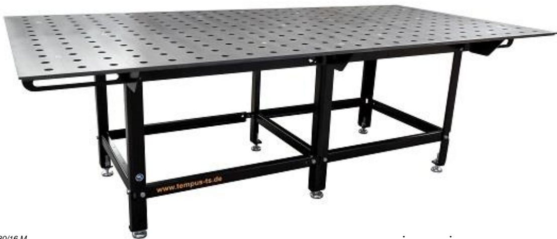
Image: SST 80/16 M