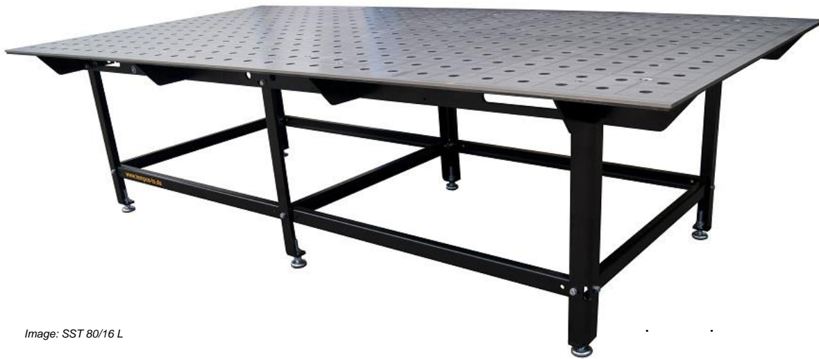
Image: SST 80/16 L