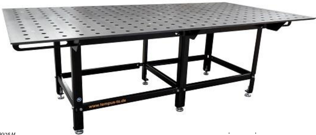
Image: SST 80/16 M