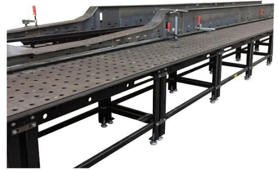
Image: Example for use SST 80/16 S