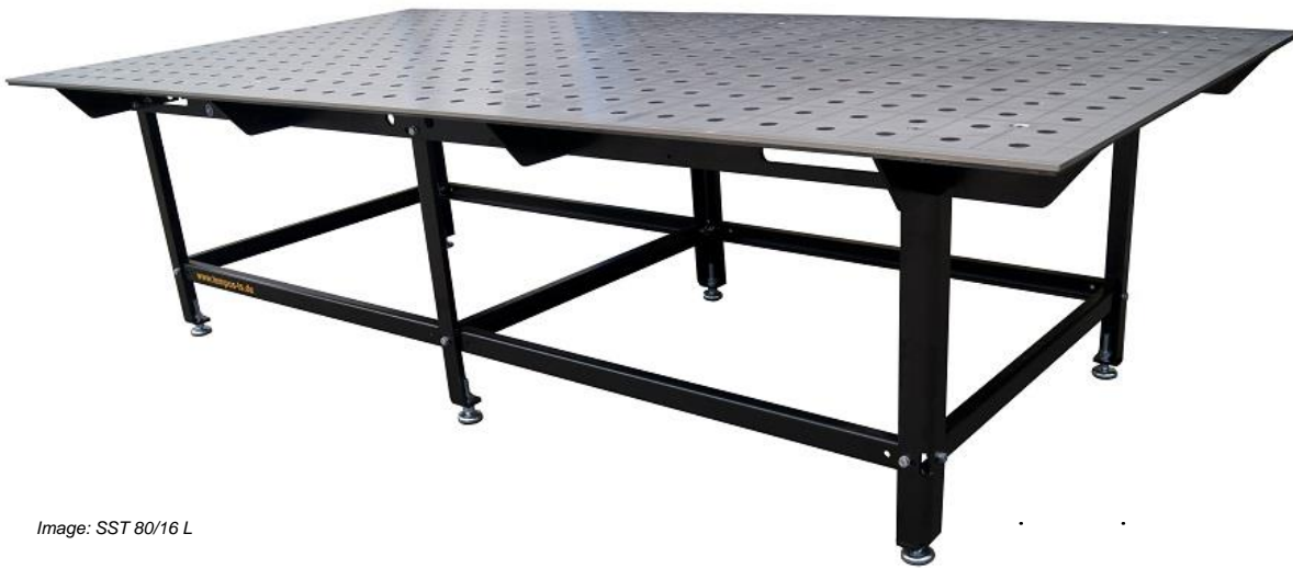
Image: SST 80/16 L