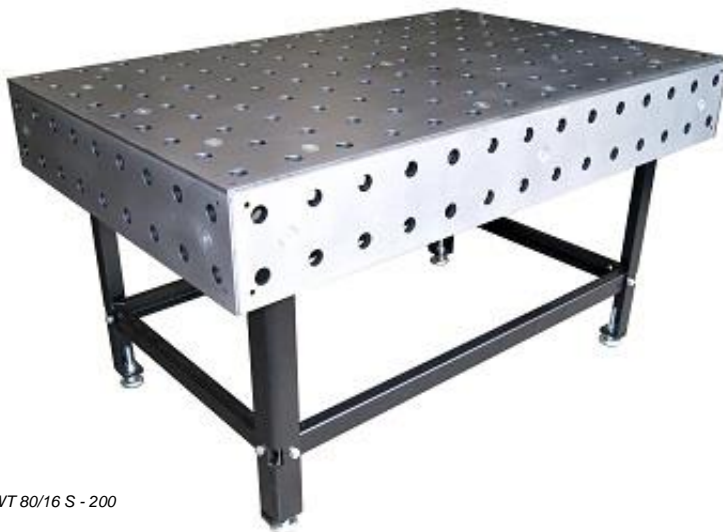
image : SWT 80/16 S - 200