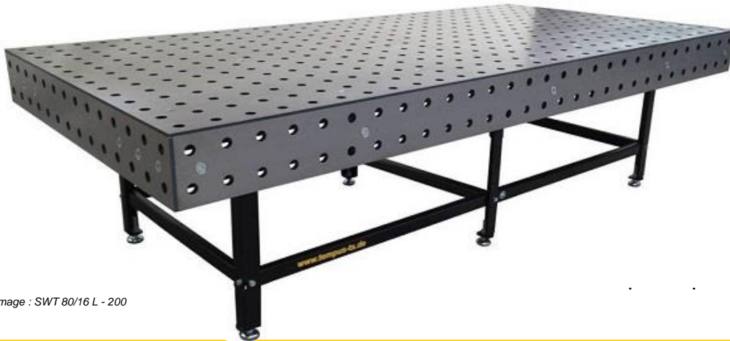
image : SWT 80/16 L - 200