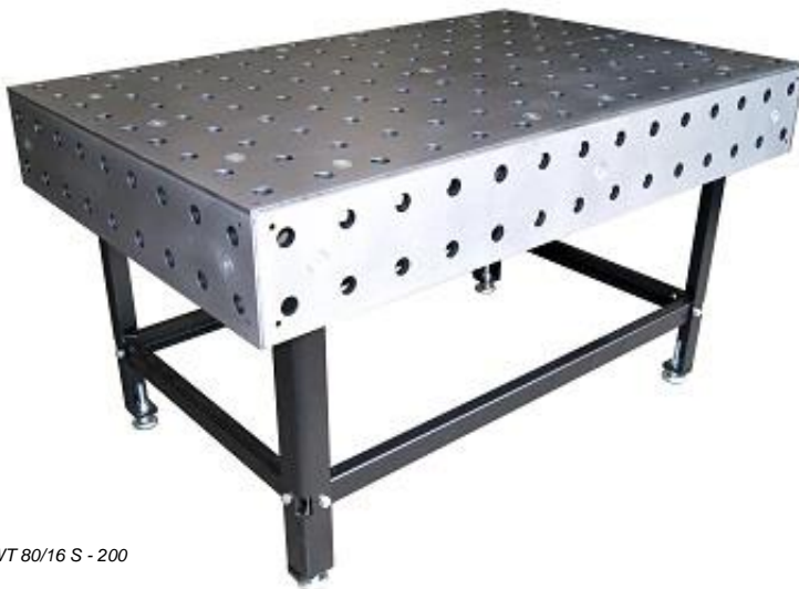
image : SWT 80/16 S - 200