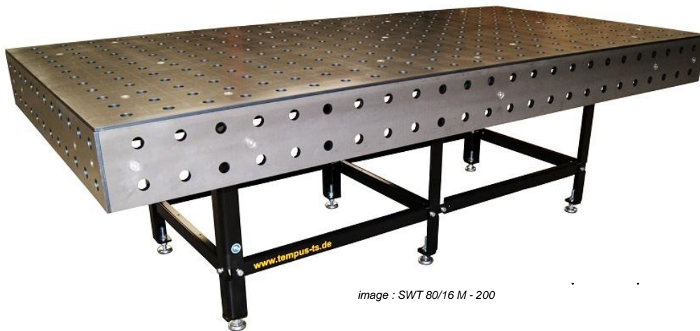
image : SWT 80/16 M - 200