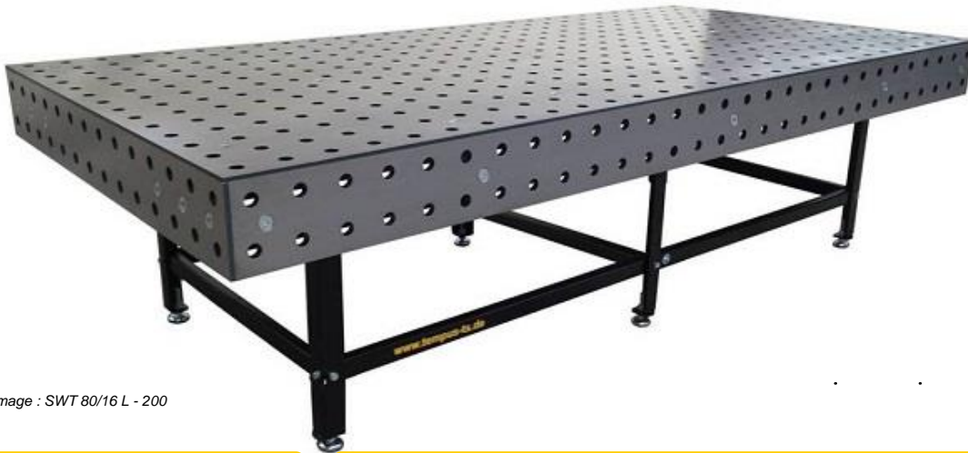
image : SWT 80/16 L - 200