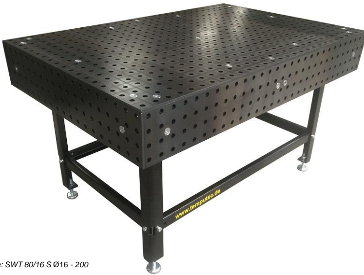
Image: SWT 80/16 S Ø16 - 200