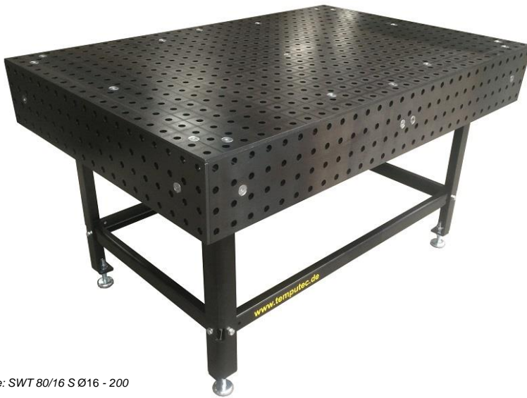
Image: SWT 80/16 S Ø16 - 200