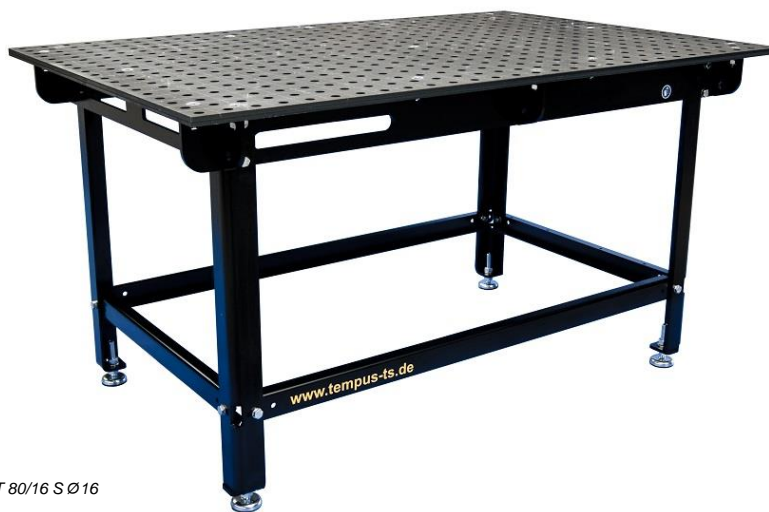
Image: SST 80/16 S Ø16