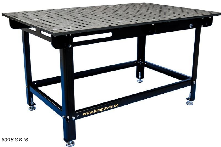
Image: SST 80/16 S Ø16