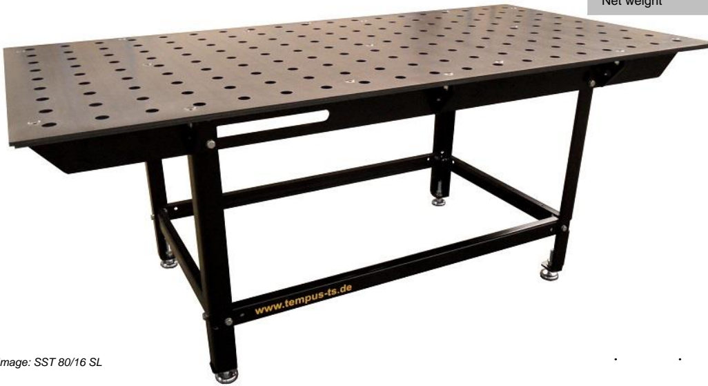
Image: SST 80/16 SL