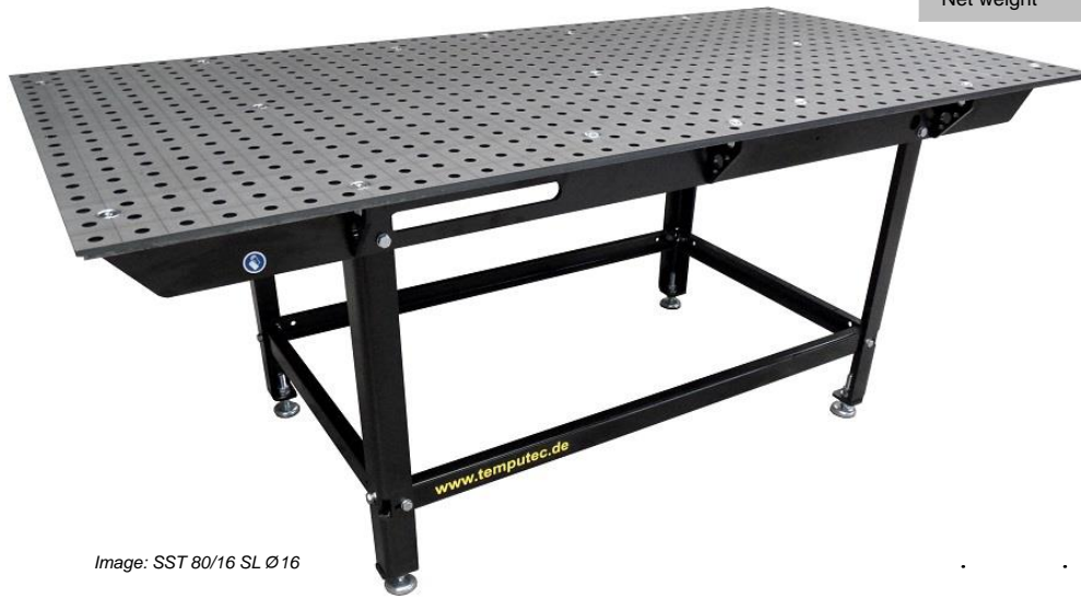
Image: SST 80/16 SL Ø16