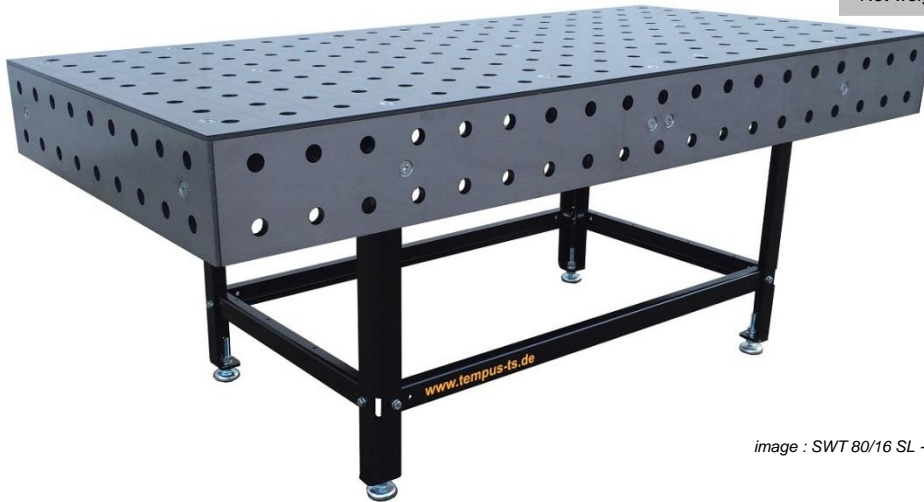
image : SWT 80/16 SL - 200