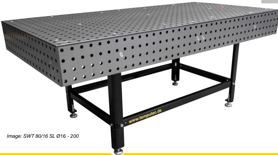
Image: SWT 80/16 SL Ø16 - 200