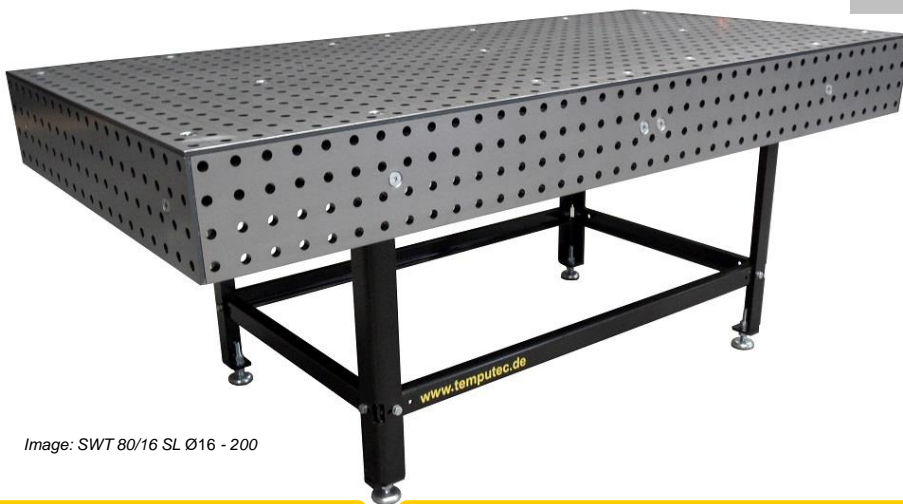
Image: SWT 80/16 SL Ø16 - 200