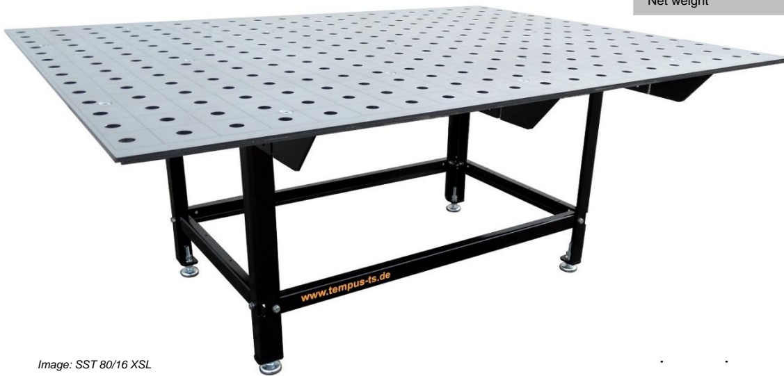
Image: SST 80/16 XSL