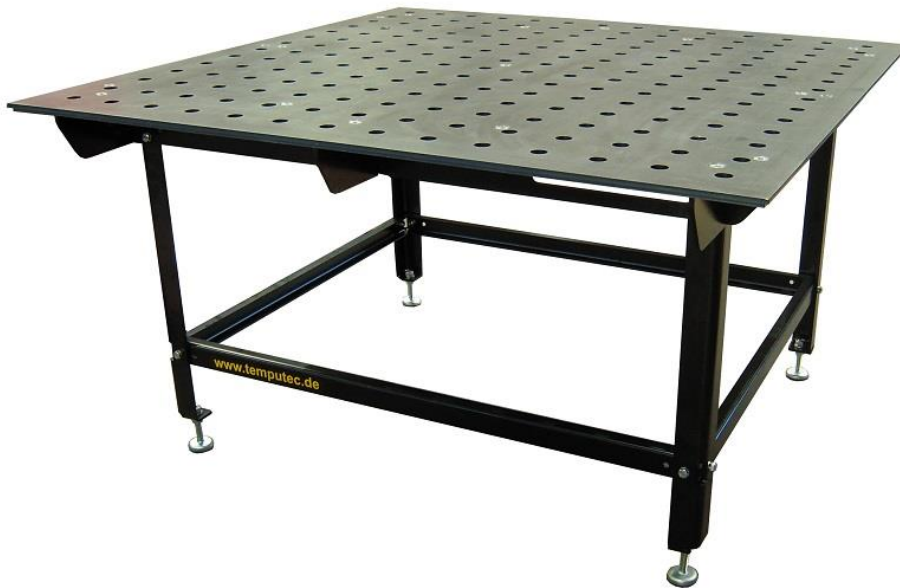
Example: SST 80/16 XS