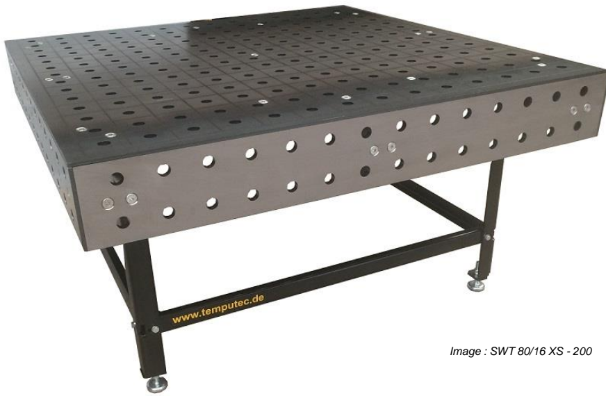
Image : SWT 80/16 XS - 200