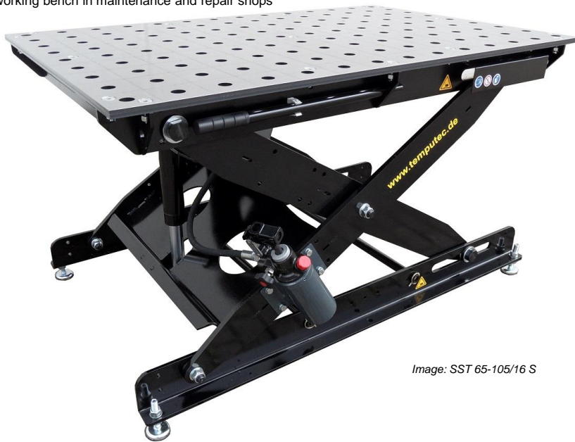
Image: SST 65-105/16 S

Gen. Industrie - Ergonomic and movable carrier for all kind of small fixtures or height adjustable multi purpose working bench in maintenance and repair shops