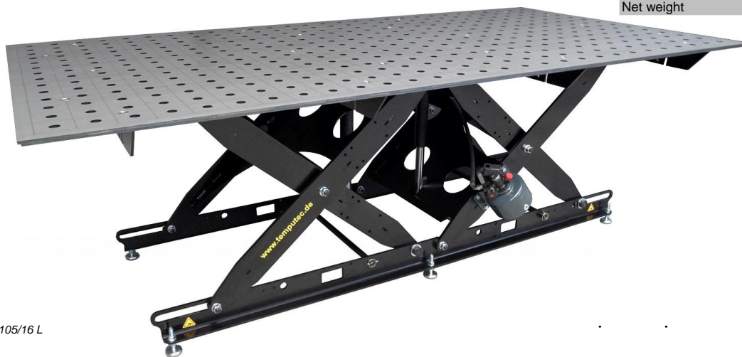
Image: SST 65-105/16 L