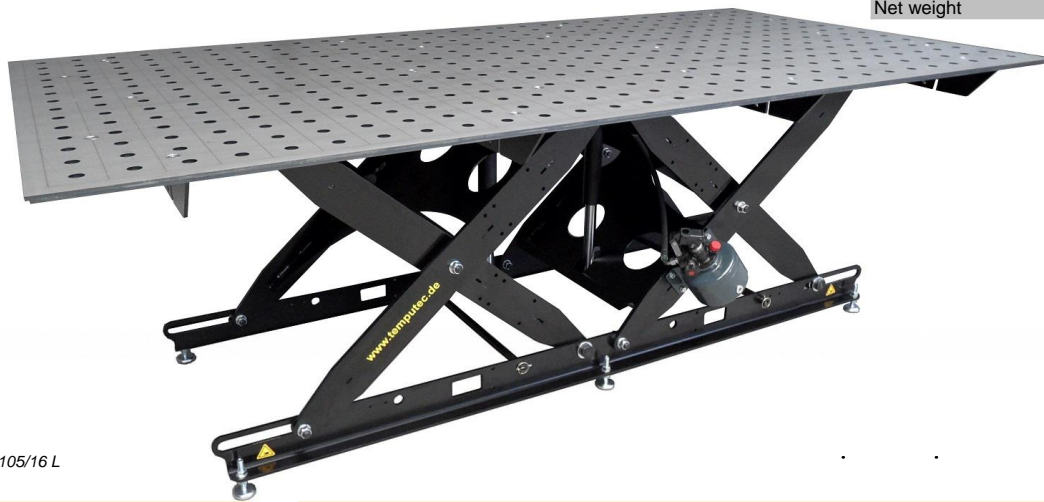
Image: SST 65-105/16 L