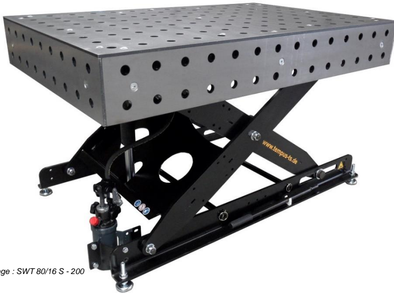
image : SWT 80/16 S - 200