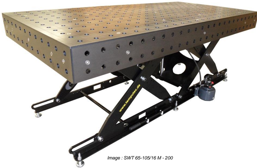
Image : SWT 65-105/16 M - 200