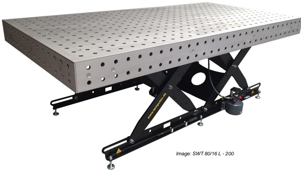
Image: SWT 80/16 L - 200