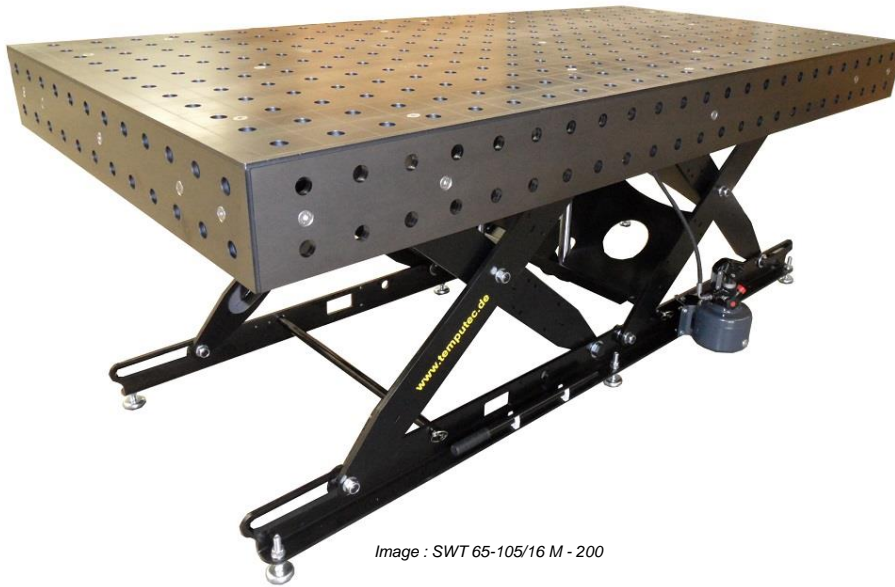
Image : SWT 65-105/16 M - 200