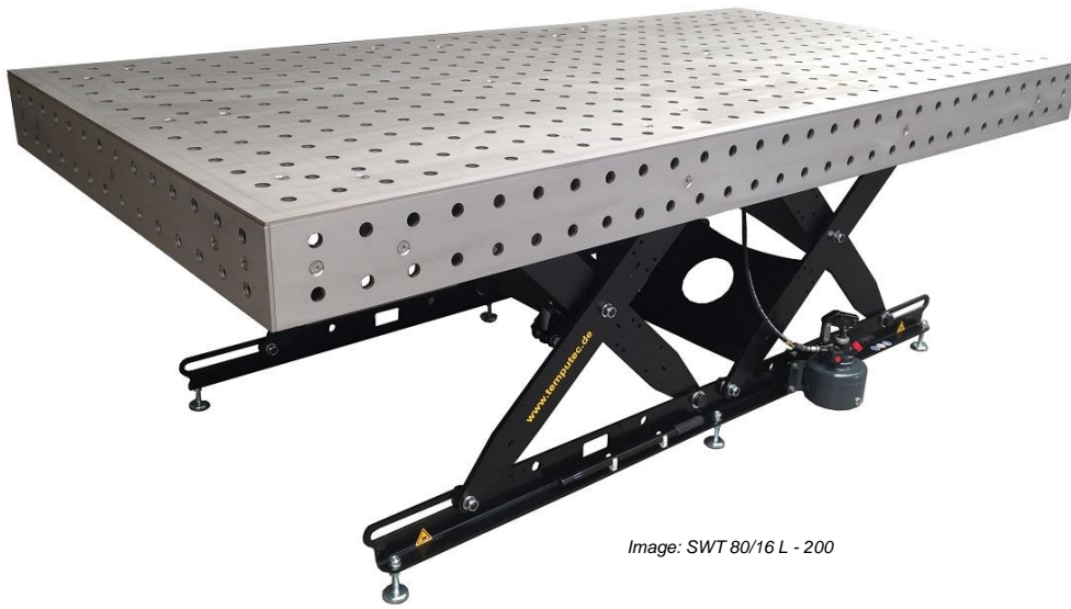
Image: SWT 80/16 L - 200