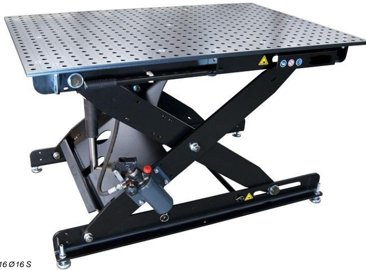
Image: SST 65-105/16 Ø16 S