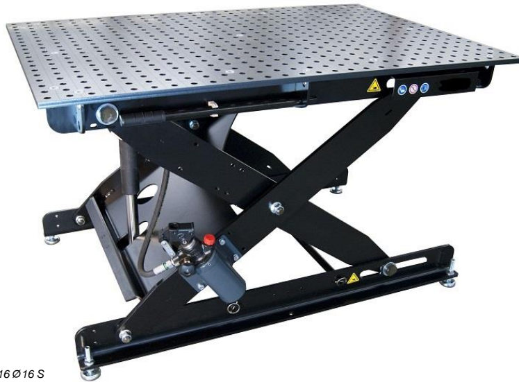
Image: SST 65-105/16 Ø16 S