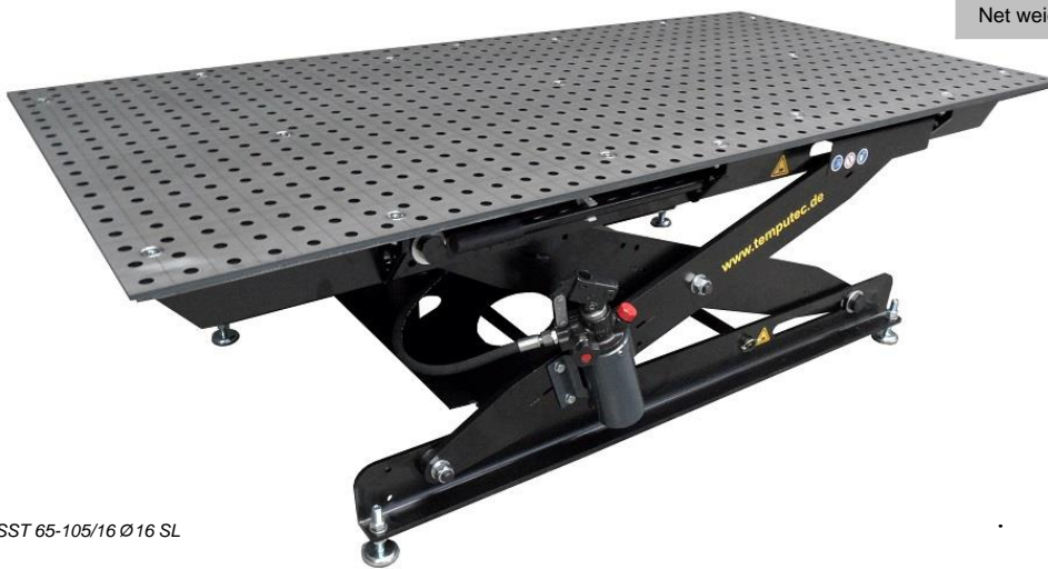
Image: SST 65-105/16 Ø16 SL