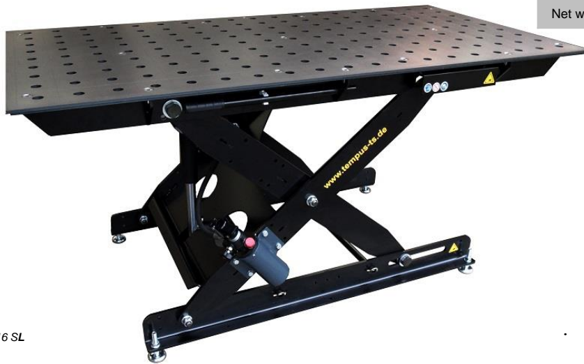
Image:SST 65-105/16 SL