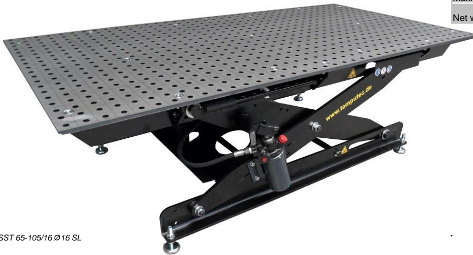
Image: SST 65-105/16 Ø16 SL