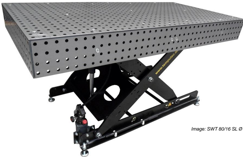
Image: SWT 80/16 SL Ø16 - 200