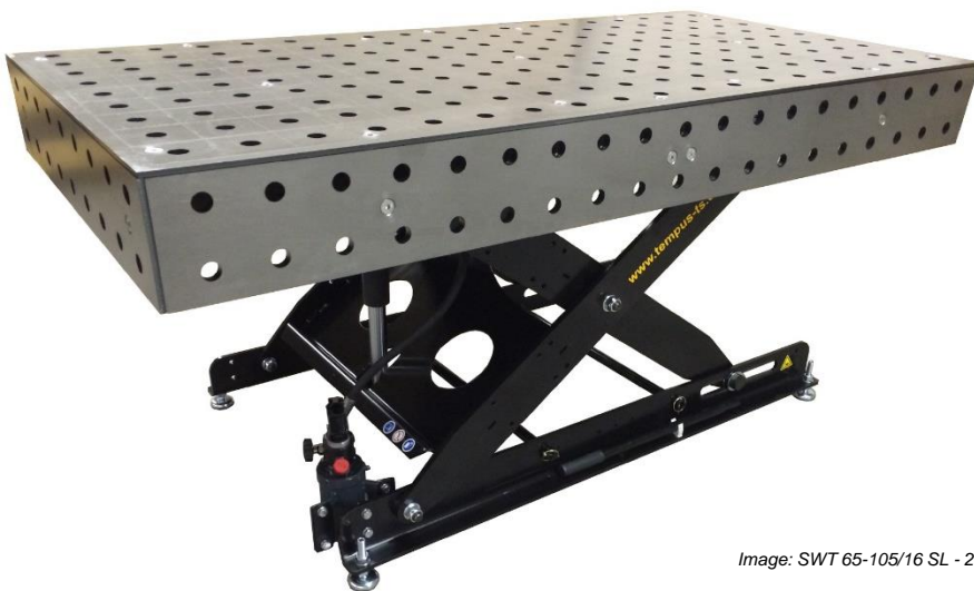
Image: SWT 65-105/16 SL - 200