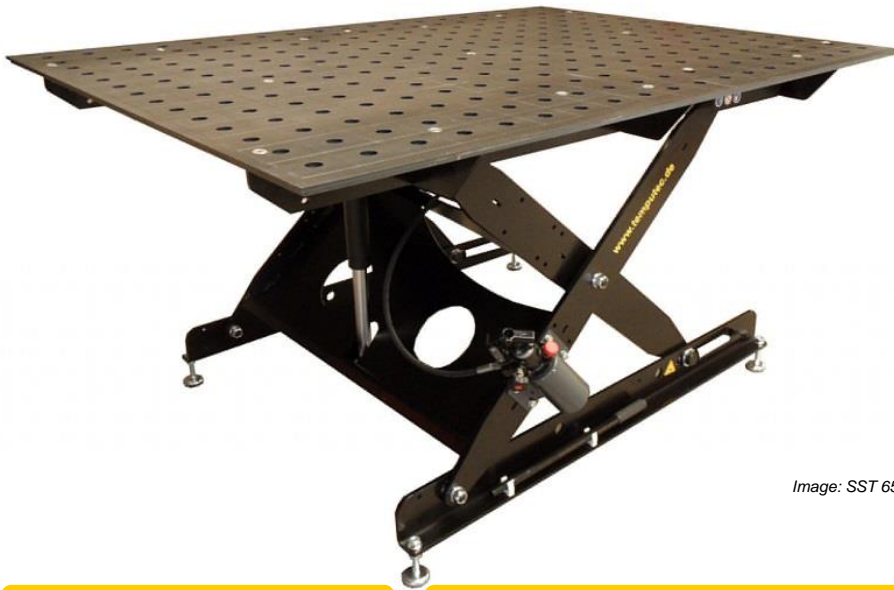
Image: SST 65-105/16 XSL