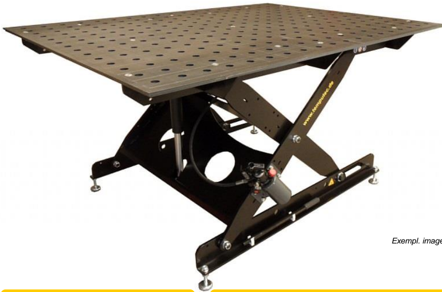
Exempl. image: SST 65-105/16 XSL