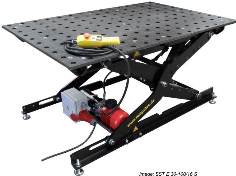
Image: SST E 30-100/16 S