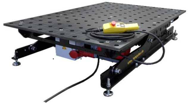
Image: SST E 30-100/16 S lower position