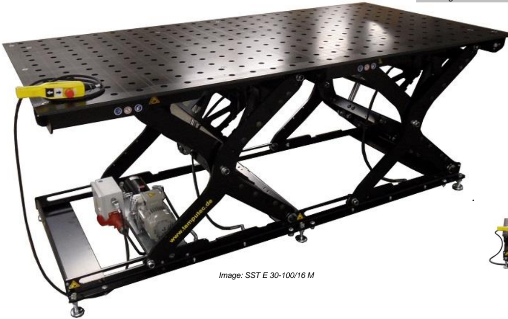
Image: SST E 30-100/16 M