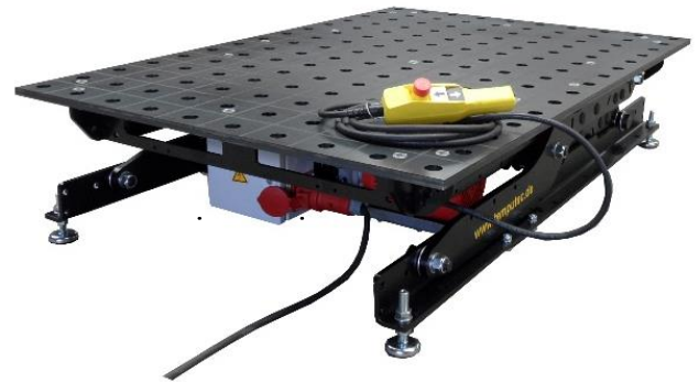
Image: SST E 30-100/16 S lower position