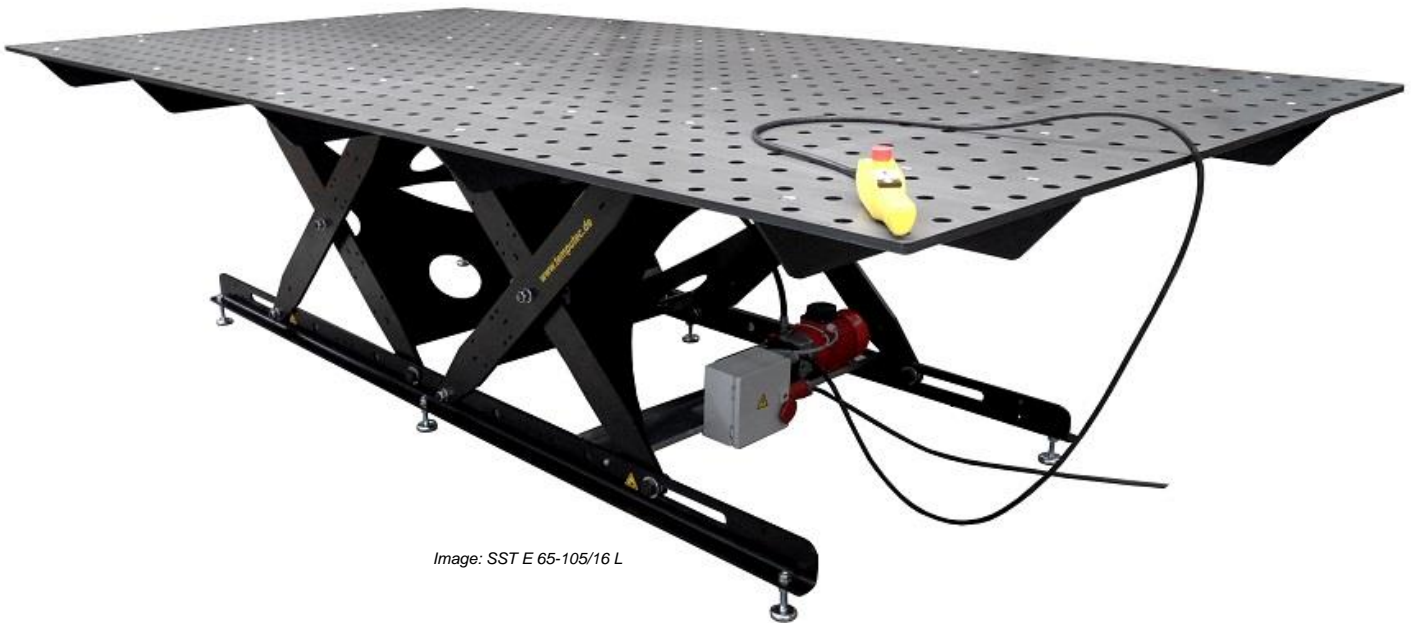
Image: SST E 65-105/16 L