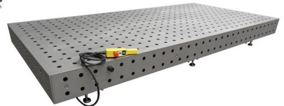
Symbol image: SWT E 35-105/ 16 L lower position