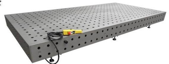
Image: SWT E 35-105/ 16 L lower position