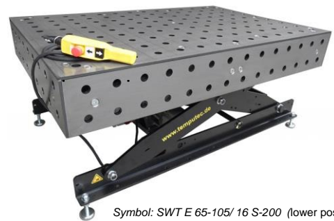
Symbol: SWT E 65-105/ 16 S-200 (lower position)