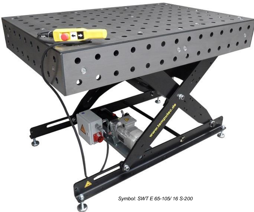
Symbol: SWT E 65-105/ 16 S-200