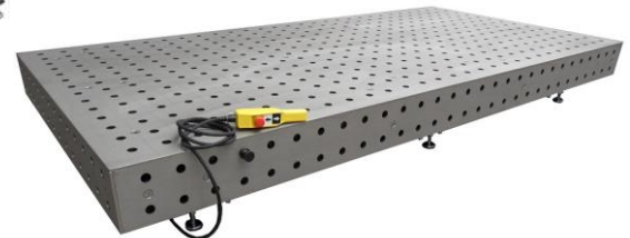
Image: SWT E 35-105/ 16 L lower position