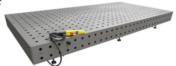
Image: SWT E 35-105/ 16 L lower position